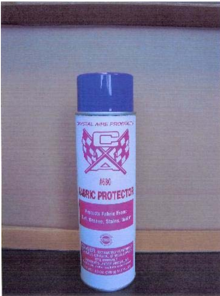
Crystal Aire Products #680 Fabric Protector