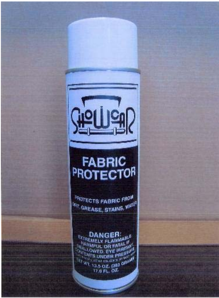
Showcar Fabric Protector