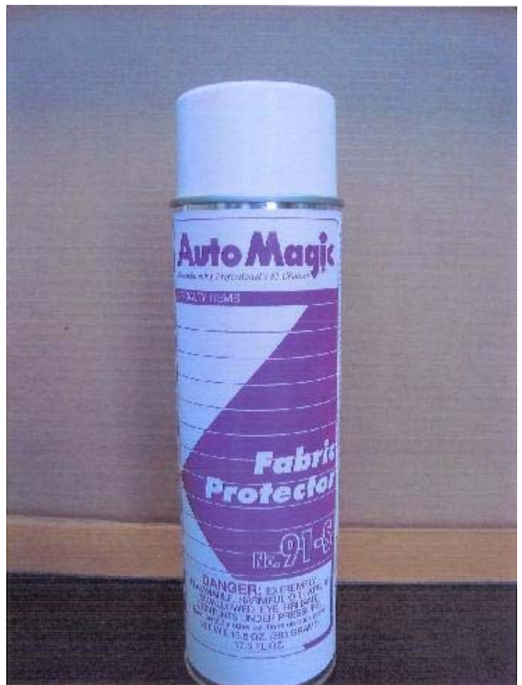
Auto Magic® Fabric Protector No. 91-S