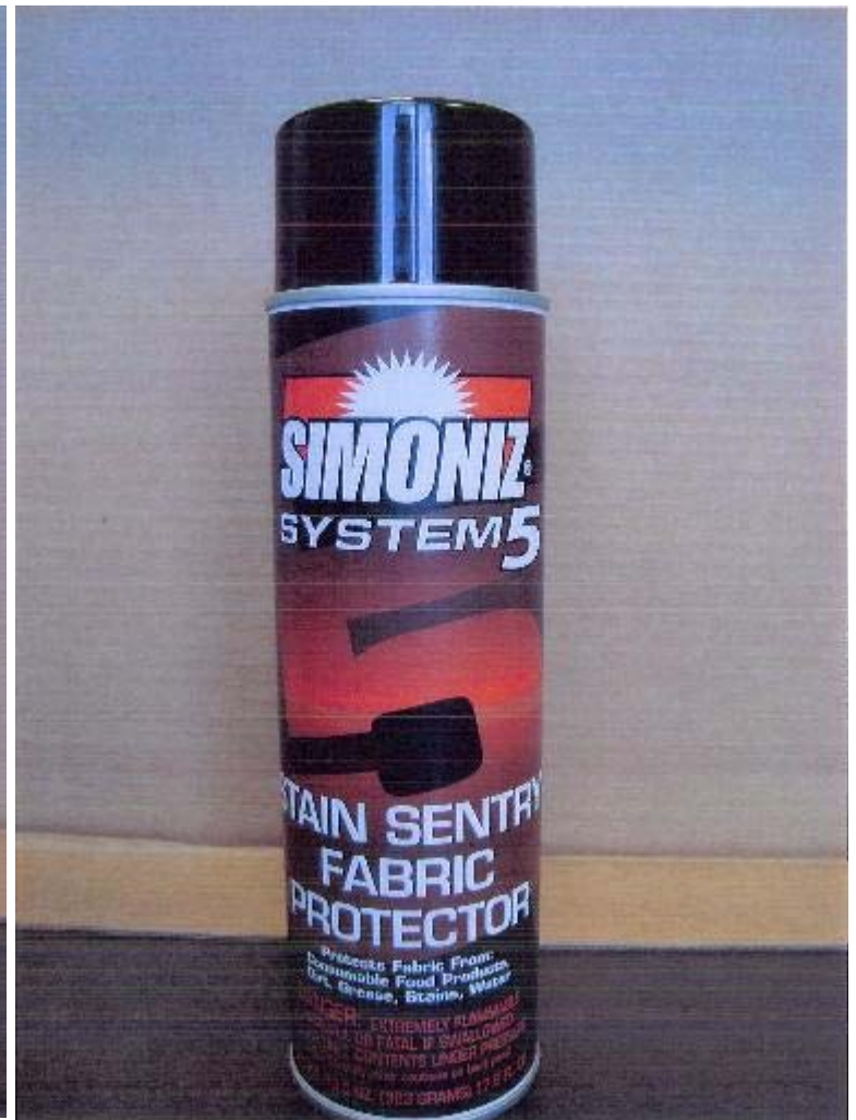
Simoniz® System 5 Stain Sentry Fabric Protector