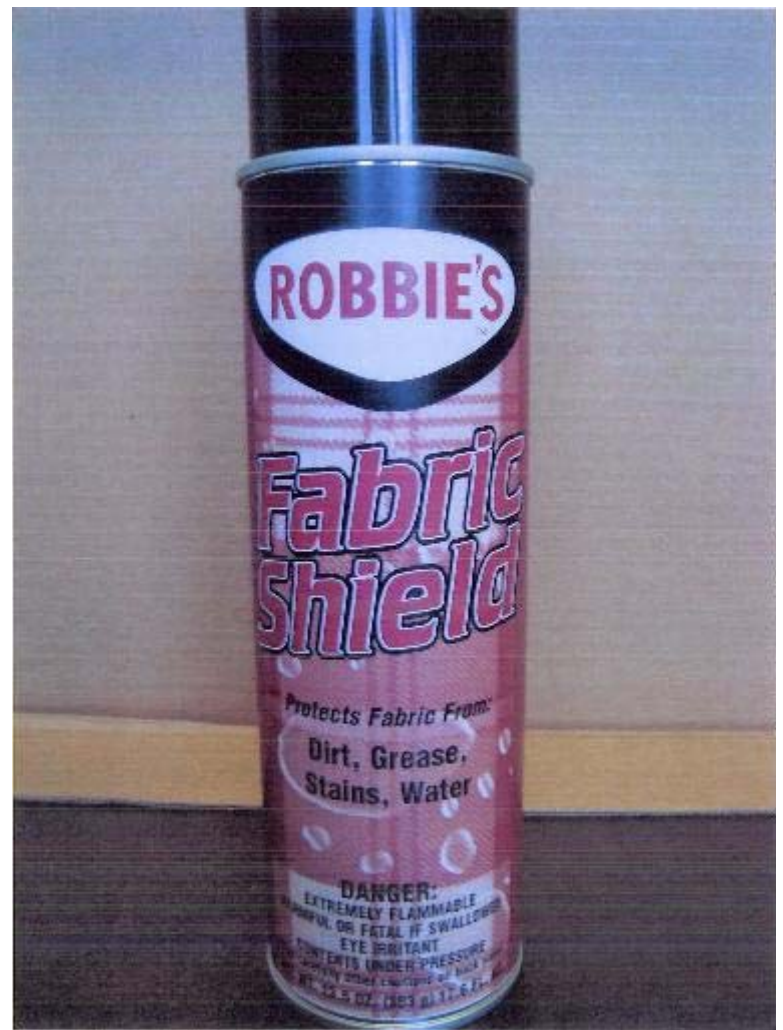
Robbie's™ Fabric Shield