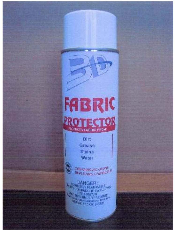
3D Fabric Protector