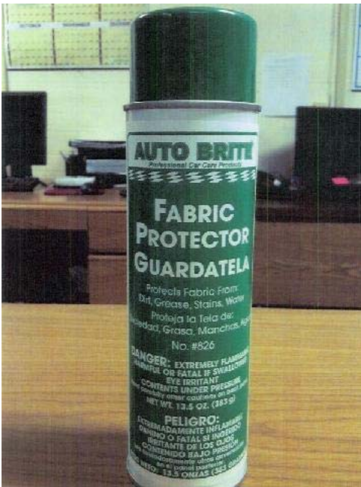
Auto Brite Fabric Protector Guardatela