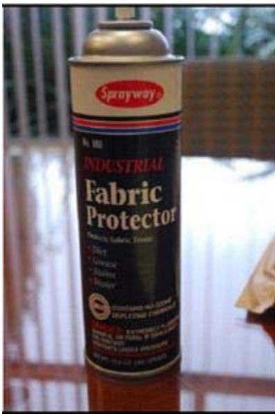
Sprayway® No. 980 Industrial Fabric Protector